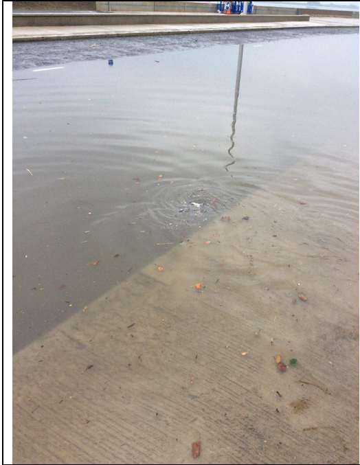
Figure 3 Swirl in the water shows that the newly installed road drainage was working in spite of some debris blockages.

In conclusion very heavy rain combined with a high tide and debris from St. Annes Park resulted in the flood event. The objective of the recently completed project was to reduce the risk of coastal flooding and to improve road drainage and those objectives have been achieved. This will currently happen every 2-5 years, increasing in frequency into the future.